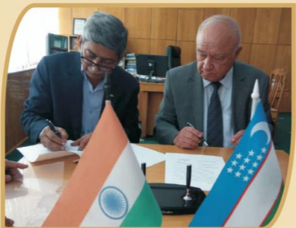
Vice Chancellor signing MoU with TSIOS at Tashkent