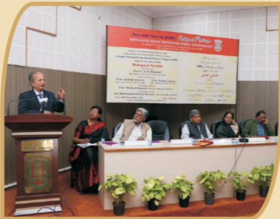
Inaugural session of National Urdu Social Science Congress