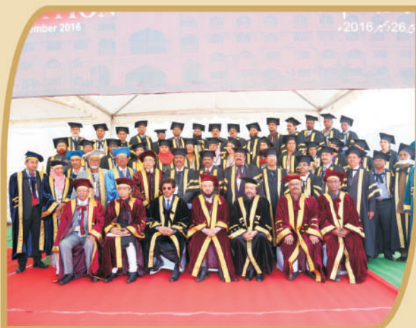
6 th Convocation of MANUU. Bollywood star Shah Rukh Khan receiving Honorary Causa