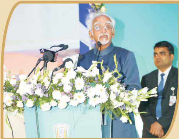
Hon'ble Shri M. Hamid Ansari, the then Vice President of India delivering first Quli Qutb Shah Memorial lecture