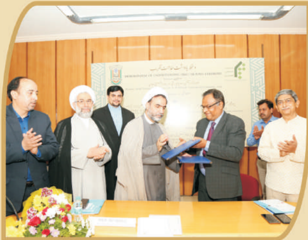
MoU between MANUU & Al-Mustafa International University, Iran