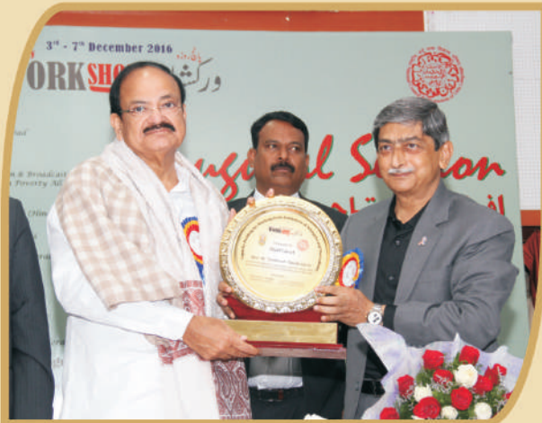
Hon'ble Shri M. Venkaiah Naidu (Presently Hon'ble Vice President of India) during a function at MANUU