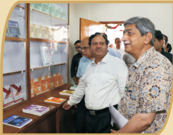
Vice Chancellor after the Inauguration of Books Sales Counter of Directorate of Translation & Publications